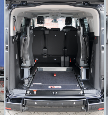
With the optional EASY FLEX ramp folded down the luggage compartment is fully usable.